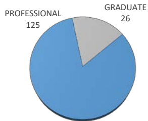
CREDIT HOURS ENROLLMENT BY CLASSIFICATION